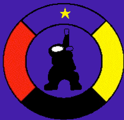
Alaska Native Science Commission