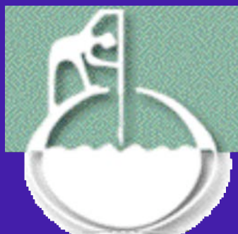
Institute of Social & Economic Research