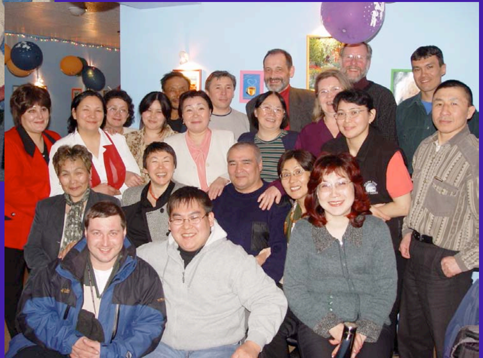
RAIPON Chukotka Team