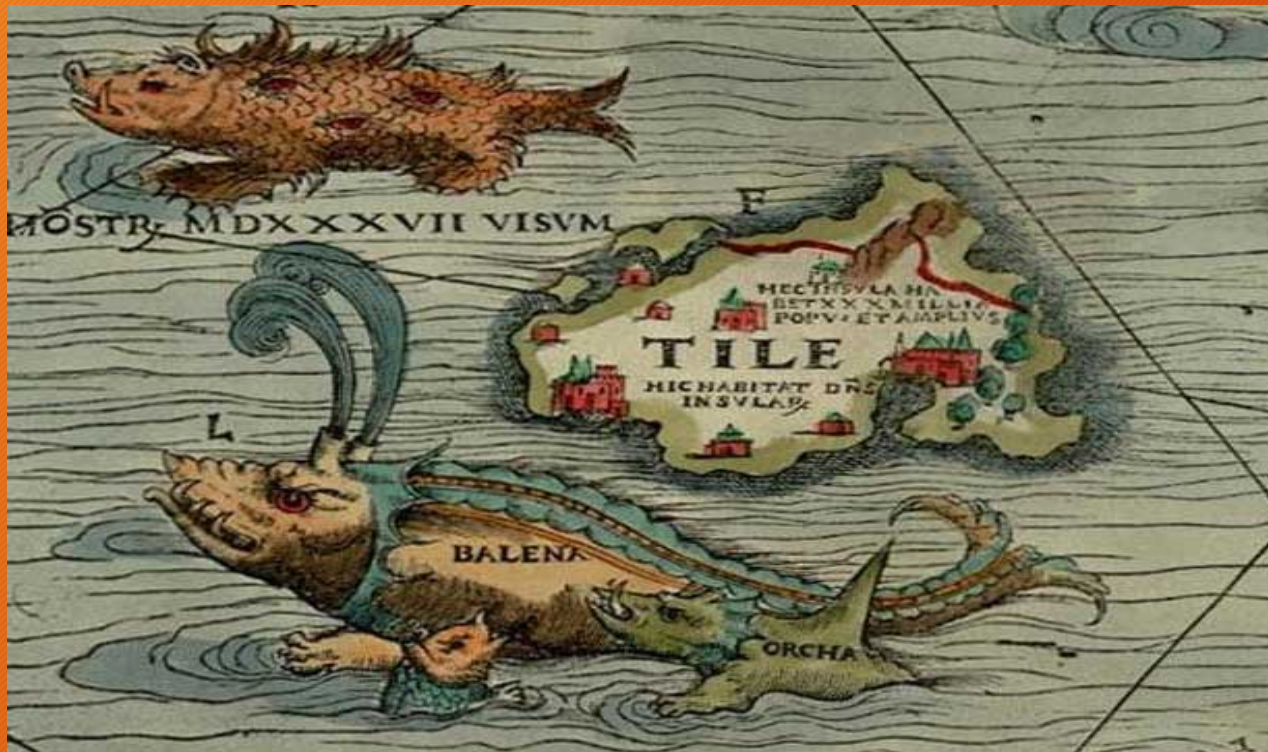
Olaus Magnus's Carta Marina (1539)