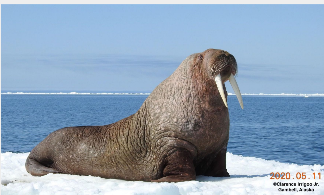
Walrus resting on ice near Gambell in mid-May.