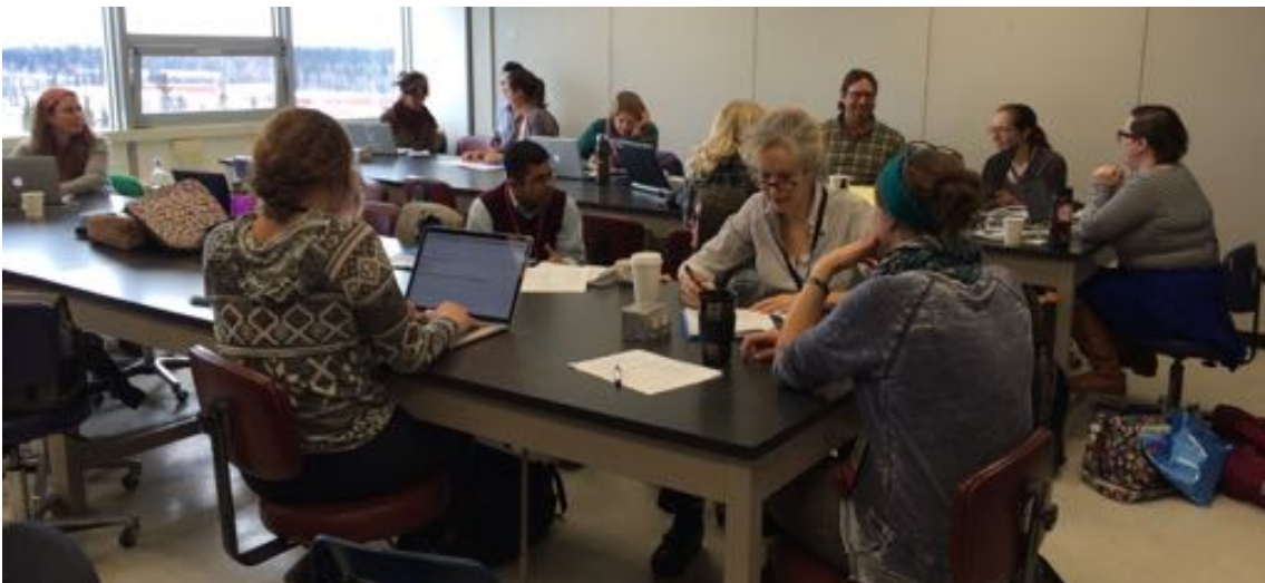
Workshop participants formed groups based on criteria such as science/education goals, geography, and other professional interests. Significant workshop time was spent in these groups developing their ideas for collaboration.

Days one and two of the workshop were dedicated to building a professional community of educators and researchers that are working, conducting research, living, and/or teaching in arctic communities. Participants and expert presenters shared their knowledge, experience, and advice to co-create the workshop space for collaboration. Day three of the workshop leveraged the common day events of the concurrently held Arctic Science Summit Week (ASSW) that brought over one thousand scientists, policymakers, and stakeholders to Fairbanks, Alaska for 12-18 March 2016.