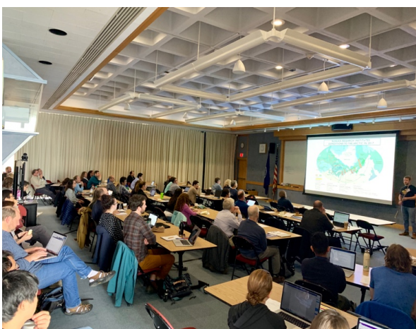
Picture 1. Plenary SAS session

The workshop was held over two full days and comprised plenary and breakout sessions focused on one or more of the twelve specific goals of the workshop (Table 1 and Workshop Agenda, Appendix A). Fifty-nine scientists participated in the workshop. Of these, seventeen were early career and nineteen were from international universities or agencies (Appendix B).