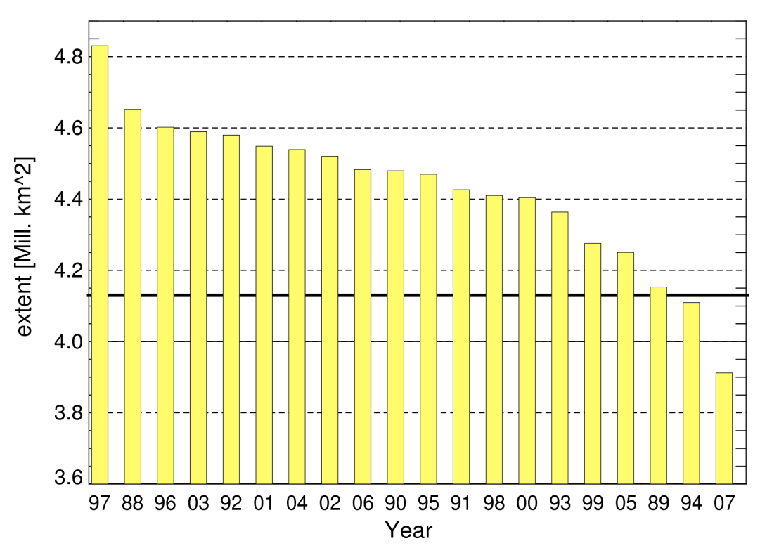
Figure 3 : Simulated minimum sea-ice extent in 2008 [Mill. km<sup>2</sup>] when forced with atmospheric data from each year between 1988 and 2007 from the initial state of June 27, 2008. Model derived ice extents have been adjusted with a constant offset to account for discrepancies with satellite-derived ice extents. The thick black horizontal line displays the minimum ice extent observed in 2007.

The probability that in 2008 the ice extent will fall below the minimum from September 2007 is about 8%, the probability to fall below the minimum of 2005 (second lowest value in the last 20 years) is practically 100%. With a probability of 80% the minimum ice extent in 2008 will be in the range between 4,16 and 4.70 million km<sup>2</sup>.