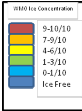
Figure 3: WMO Sea Ice Color codes for Ice Concentration.

(CAVEAT: This is not an official National Ice Center forecast and should not be interpreted as advice for navigation. Only ice-capable ships with experienced ice pilots should attempt navigation in the Arctic, and should consult with local authorities for current ice conditions and navigational restrictions.)