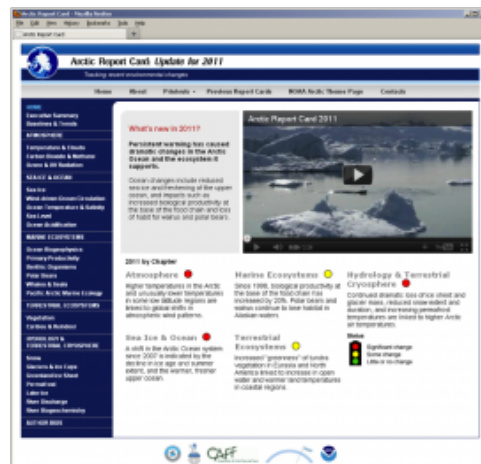
2011 Arctic Report Card

To read the 2011 Arctic Report Card, an executive summary, and previous Arctic Report Cards please go to: